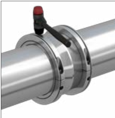
Figure 5. Tap the clamp rings with soft mallet at assembly