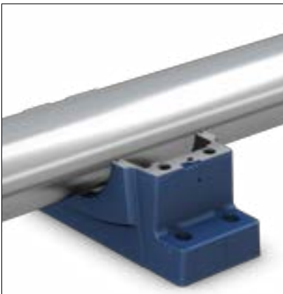
Figure 1. Shaft in split housing

Do not remove the rollers from the cage. The outer ring and shroud are supplied pre-assembled. Remove the shroud joint screws only. Do not remove the radial screws that fasten the outer ring halves into the shroud halves. Otherwise follow procedure given in step 2.