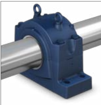
Figure 11. Split block housing with bearing on shaft

The caps and bases of individual split block housings are not interchangeable with other housings.