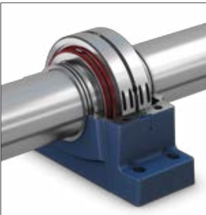
Figure 10. Sealed bearing in housing base

The original split block housing seals can be used. Alternatively, use the SKF TX (metric) machined contact seals with the SKF SNL, SNLD or SKF Mining Specific housing (VZ2N7 suffix) split block housings or the SKF A12 (inch) machined contact seal with the SAF, SAFD, or SDAF split block housings. These seals can be split at installation as required. Follow the fitting instructions supplied with the seals.