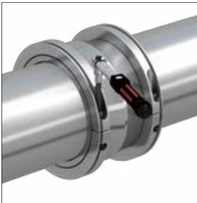
Figure 6. Inner ring and clamp rings on shaft. Note the gap between the rings

If soft joint packing was used to assist with inner race gap equalization then carefully trim off any excess that may protrude. If shims were used then remove them.