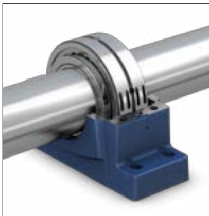
Figure 8. Fully assembled bearing in housing

Apply additional grease as necessary to pack the bearing. Place the top half of the shroud/outer ring assembly onto the bearing. Insert the shroud joint screws; check that the outer is not binding on the rollers as you progressively tighten the screws to the specified torque. See Table 1 . There should be no gap at the shroud joints. Apply additional grease as necessary to pack the bearing.