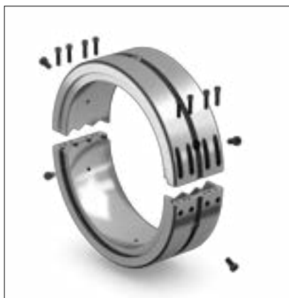
Figure 2. Outer ring and shroud with radial screws and shroud joint screws

With a light oil, lubricate the joint interfaces and then place the halves together and insert the shroud joint screws. Loosen the radial screws slightly before fully tightening the joint screws. Then fully tighten the radial screws to the specified torque using a torque wrench. See Table 1 .