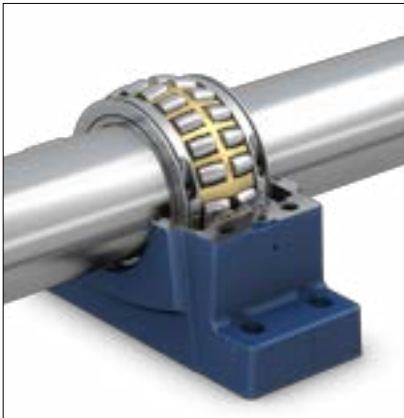
Figure 4. Bearing inner ring, clamp rings, rollers and cage in lower outer ring and shroud

For a non-locating bearing the shroud should be positioned centrally between the housing shoulders. Use a soft-faced mallet to tap the inner ring along the shaft until it perfectly aligns with the outer ring. To check/assist alignment, place a half cage onto the inner ring then rotate it carefully into the lower half outer ring. Then tighten clamping ring screws and remove the half cage .